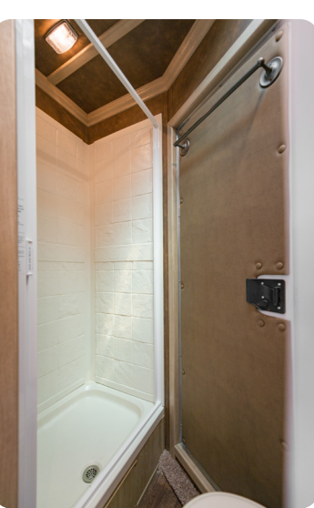
SHOWN WITH OPTIONAL FEATURES.